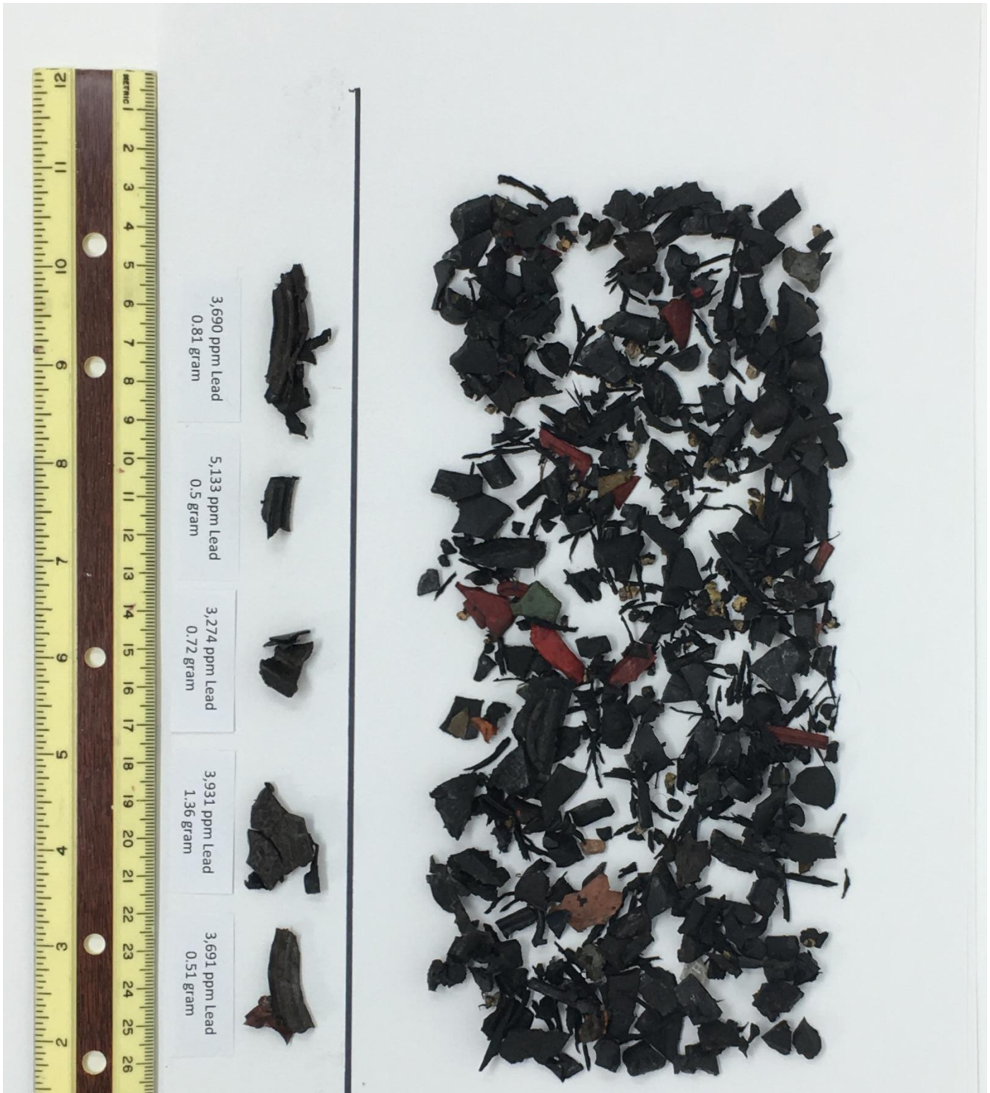
Rubber shred material from poured in place (PIP) playground at Takoma Education Campus, 7010 Piney Branch Rd. NW, (measurement units centimeters)