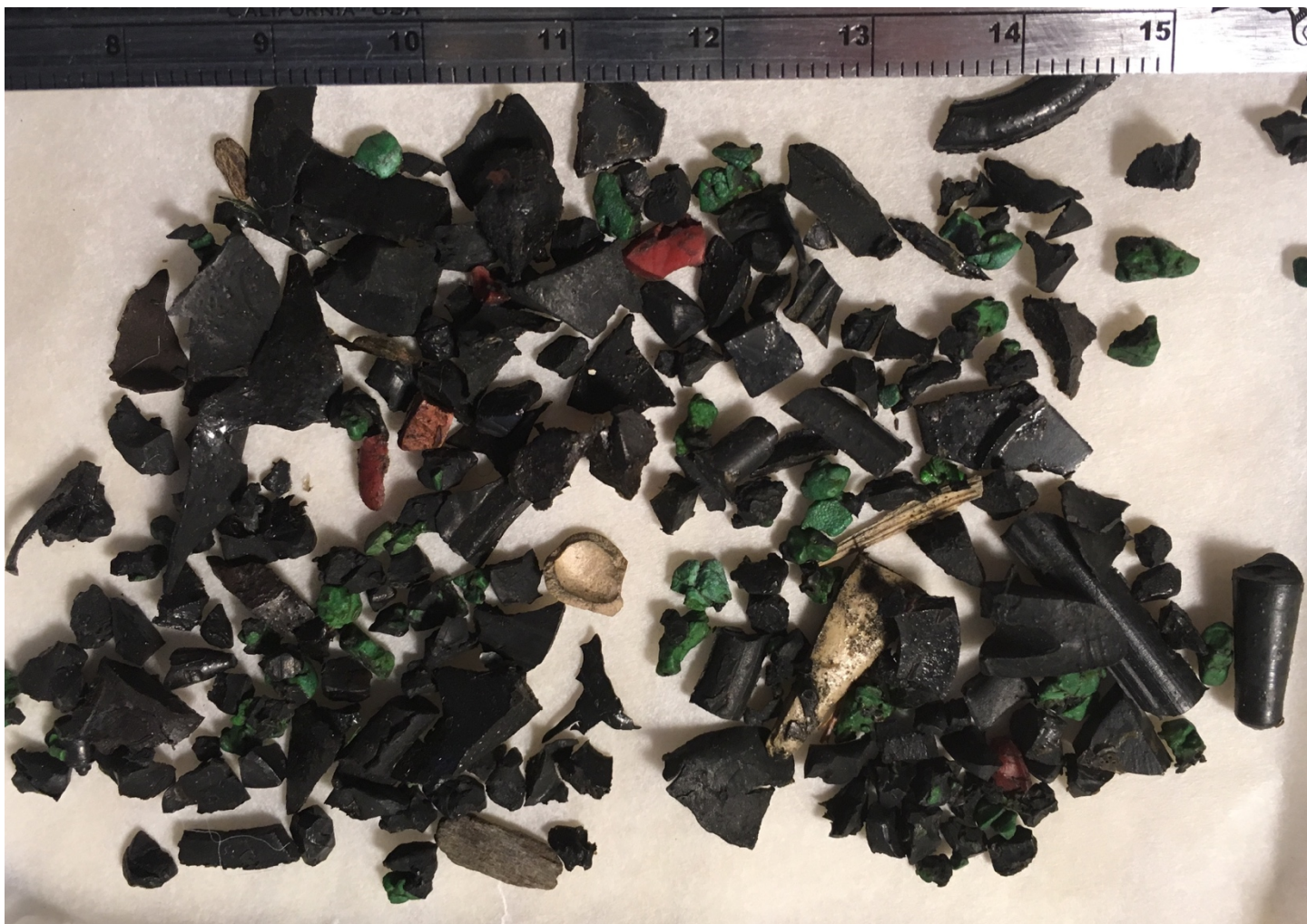
Rubber shred material from poured in place (PIP) playground at Janney Elementary School, (measurement units centimeters)